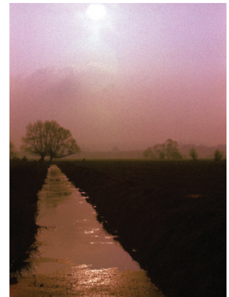
Winter sometimes brings early morning mist that blankets the moors