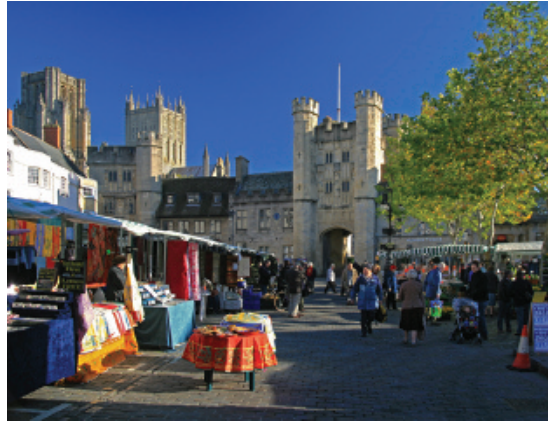
Market day, Wells