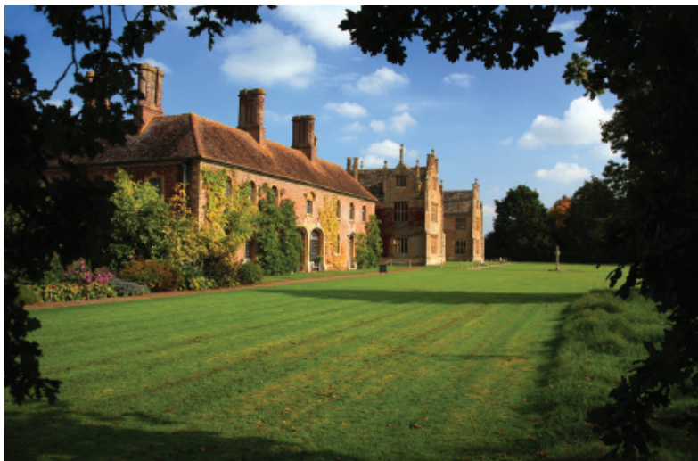
Barrington Court is another magnificent sixteenth-century manor house near Ilminster.