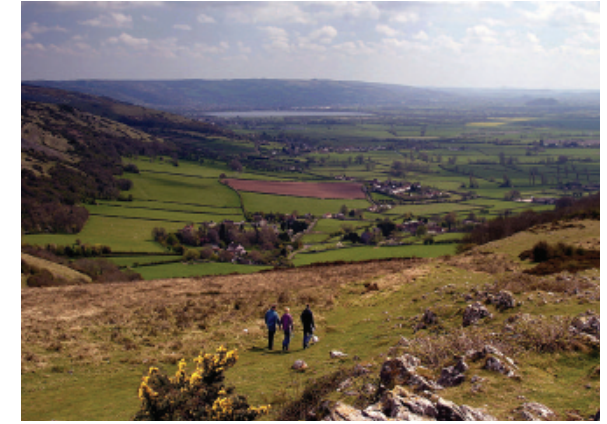
A group of walkers descend from the distinctively shaped Crook Peak at the western end of Mendip.