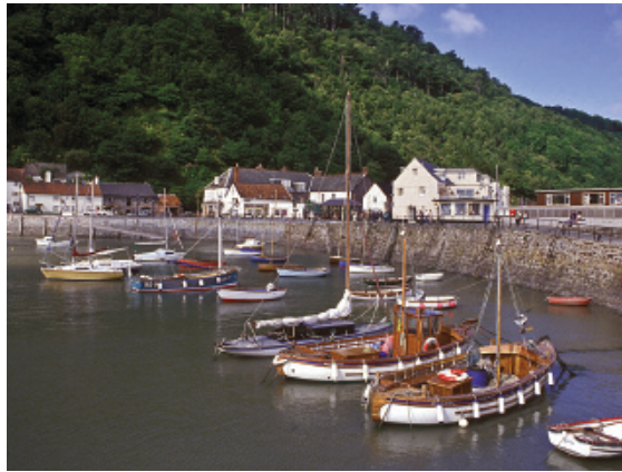
Minehead is another Victorian seaside resort with a harbour set against a backdrop of picturesque wooded cliffs.